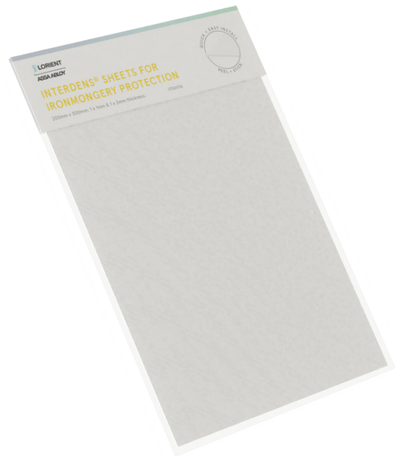
A4 MAP sheets