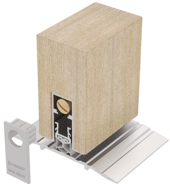
LAS8007 si (shown with LAS4011)