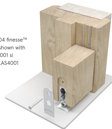
LP1504 finesse™ seal shown with LAS8001 si and LAS4001

The products do not fall within the scope of COSHH regulations. Lorient intumescent seals should be stored flat in a clean, dry, dust-free area away from heat and at a storage temperature of between 5°C and 40°C.